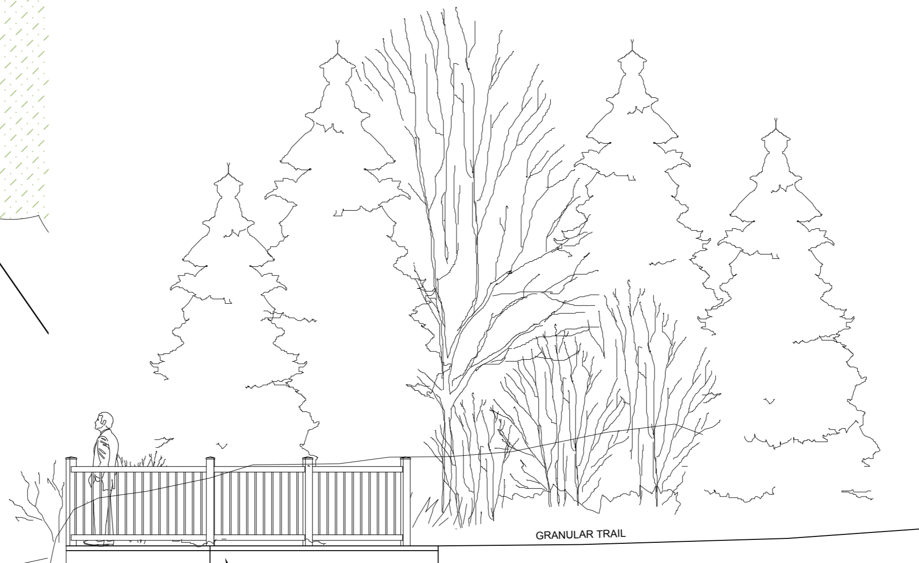
VIEWING DECK ELEVATION SCALE 1:50